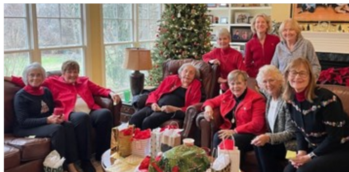
Faith & Fellowship Circle ~ "Christmas Fun"

The Faith & Fellowship Circle will meet Thursday, January 11 th at 11 a.m. in the parlor. Following a devotion and some short business, they will construct pillows for the Mended Hearts Cardiac Recovery program. Bring your fabric scissors for cutting out the shapes, the hearts will then be sewn, and we will stuff as many as time permits. Don't forget to bring your sack lunch and beverage for our fellowship time together following the project.